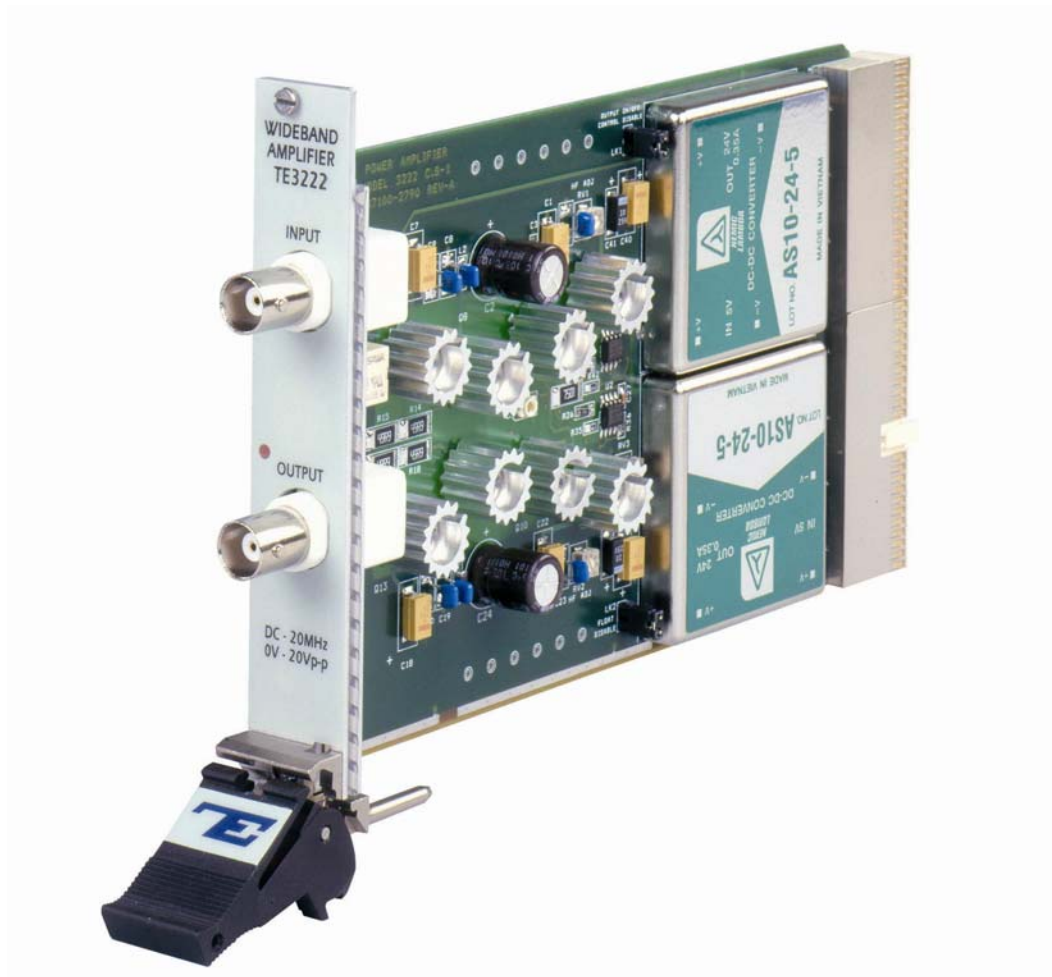
Figure 1-1, TE3222