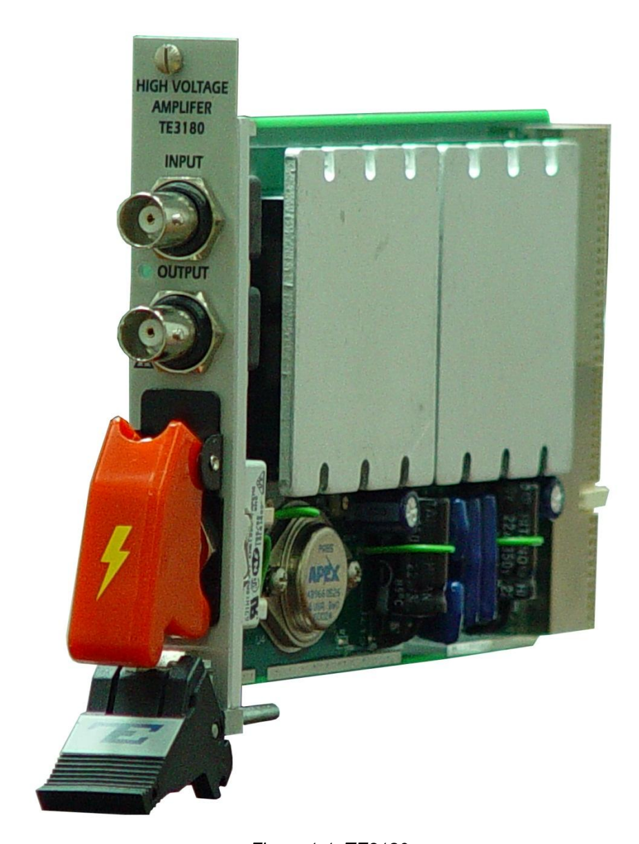
Figure 1-1, TE3180